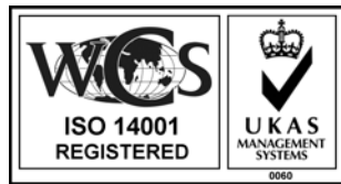
Certificate No. EN 1226