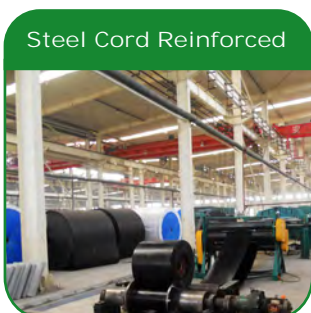
Steel Cord Reinforced

The selection of the most suitable conveyor belt construction for a particular application